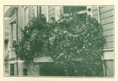
California Moss. Bright rosy pink flowers.